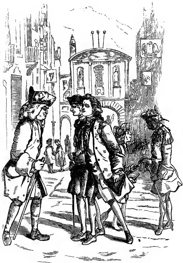
A Rencontre in Fleet Street.